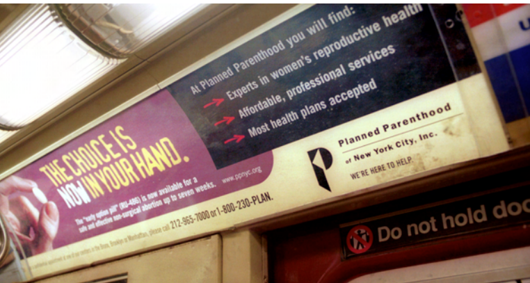
After the septic shock deaths of several women who received RU-486 from its clinics, Planned Parenthood adopted a new off-label RU-486 regimen on March 17, 2006.

The President needs to remedy the threat to women's health posed by RU-486. Six years of American RU-486 use have made clear that RU-486 doesn't just kill the unborn—it endangers the lives of those who use it. President Bush should do the right thing and reverse this approval based on the abuse of process that gained its approval and the dangerousness that characterizes RU-486. Respect for the law and concern for women's health demand no less.