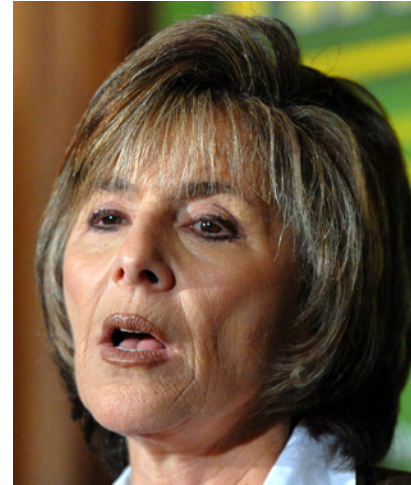
Barbara Boxer (D-CA)

“According to news reports, the FDA is considering placing draconian restrictions on the accessibility of RU-486 as a condition of its approval . . . In 1996, the FDA found RU-486 to be safe and effective. Therefore, it is a mystery to me why the FDA would even consider restricting access to it.” 47