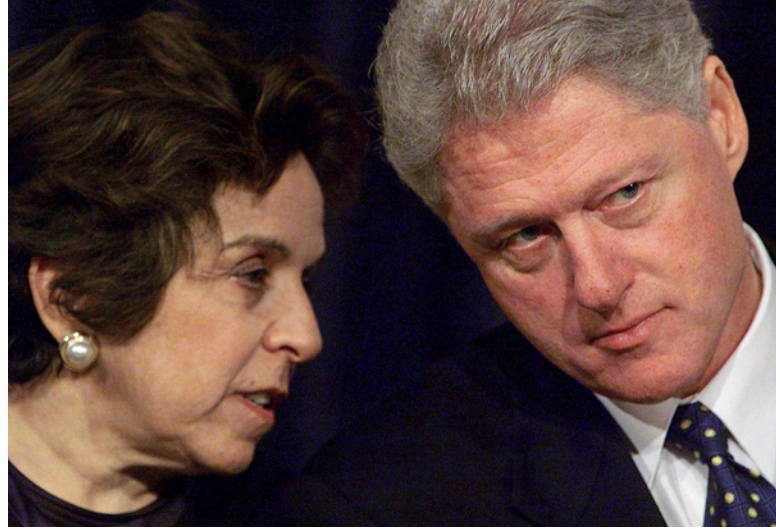
Former HHS Secretary Donna Shalala and former U.S. President Bill Clinton

President and Mrs. Clinton needed no encouragement to do the bidding of the abortion movement. Both were, and are, deeply committed proponents of abortion on demand, and the proof of this came quickly. In his second full day in office , January 22, 1993, President Clinton directed Department of Health and Human Services (“HHS”) Secretary Donna Shalala to assess initiatives to “promote the testing, licensing, and manufacturing of RU-486 or other antiprogestins in the United States.” 13 Donna Shalala and the administration’s FDA Commissioner, David Kessler, immediately launched a major effort to find an American RU-486 marketer. The administration was assisted by a major well-funded effort to place external pressure on the drug’s manufacturers, Roussel-Uclaf (“Roussel”) and its parent, Hoechst. Three