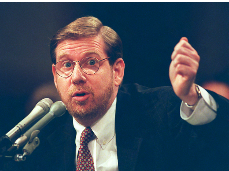
Former FDA Commissioner Dr. David Kessler

bleeding with two subsequent aspirations; convulsions reported as fainting; and expulsion which was actually a surgical evacuation; bleeding, nausea and contractions, or bleeding and pelvic pain.” 24 The FDA admonished the French investigator but still accepted the data. Worse yet, the FDA did not tell the members of the Advisory Committee that the quality of the data was suspect and rule violations had been found.