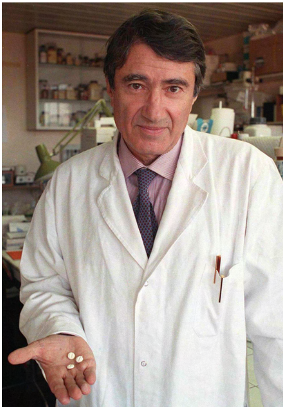
RU-486 developer Dr. Etienne-Emile Baulieu holds RU-486 pills on October 31, 1988 in Paris. The FDA announced on September 28, 2000 that the controversial abortion pill had been approved for sale in the U.S.

Since ancient times there have been many failed attempts to produce chemicals capable of aborting pregnancies. 2 Two millennia would pass before modern science could design such a drug. 3 That drug was RU-486 or mifepristone (also, Mifeprex ® ). In 1988 France became the first the nation to license RU-486, and efforts were soon under way to bring mifepristone to market in the United States. 4